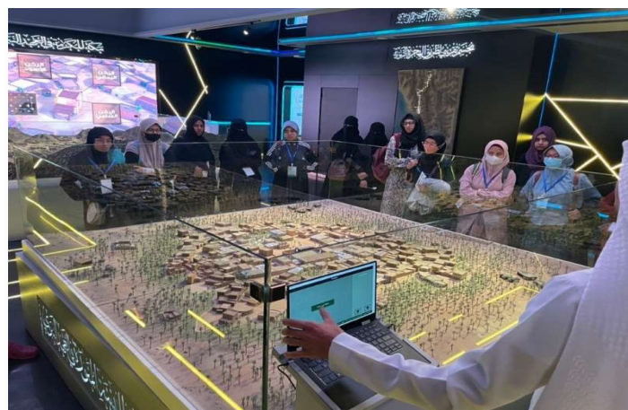
Sirah Museum in Madinah