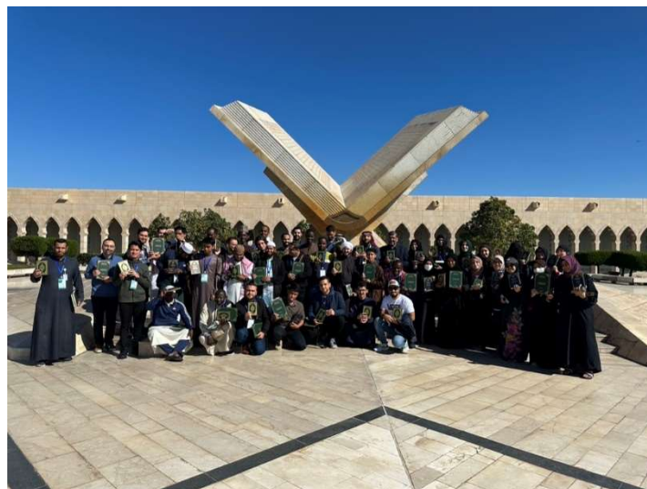
King Fahad Complex for Quran Printing