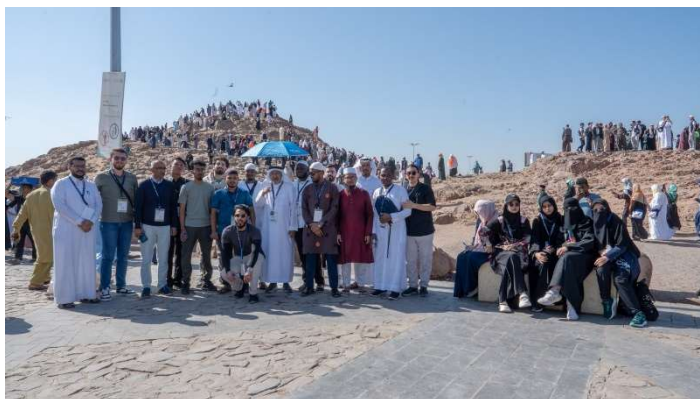
Mountain of Uhud