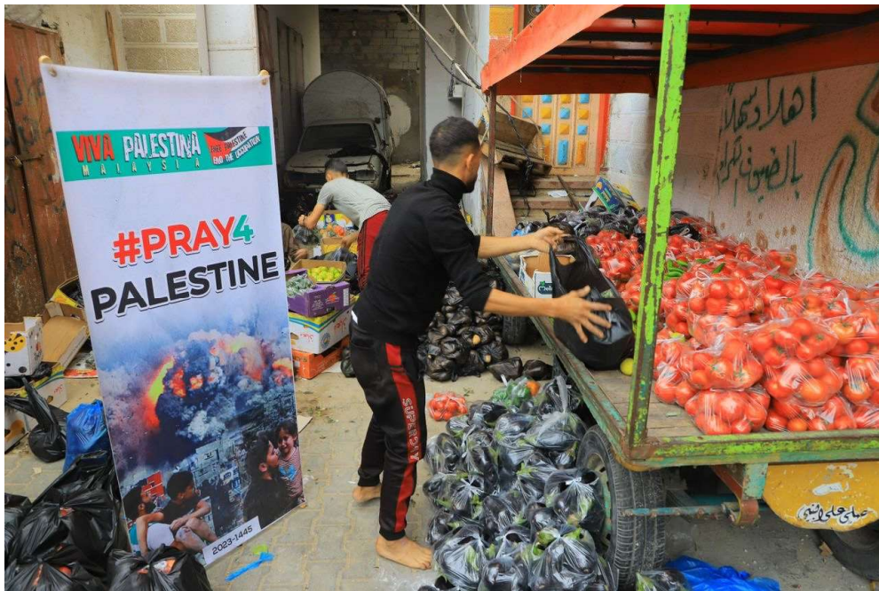
Vegetables bought from the farmers in South Gaza, which were packaged for distribution to Internally Displaced Palestinian families