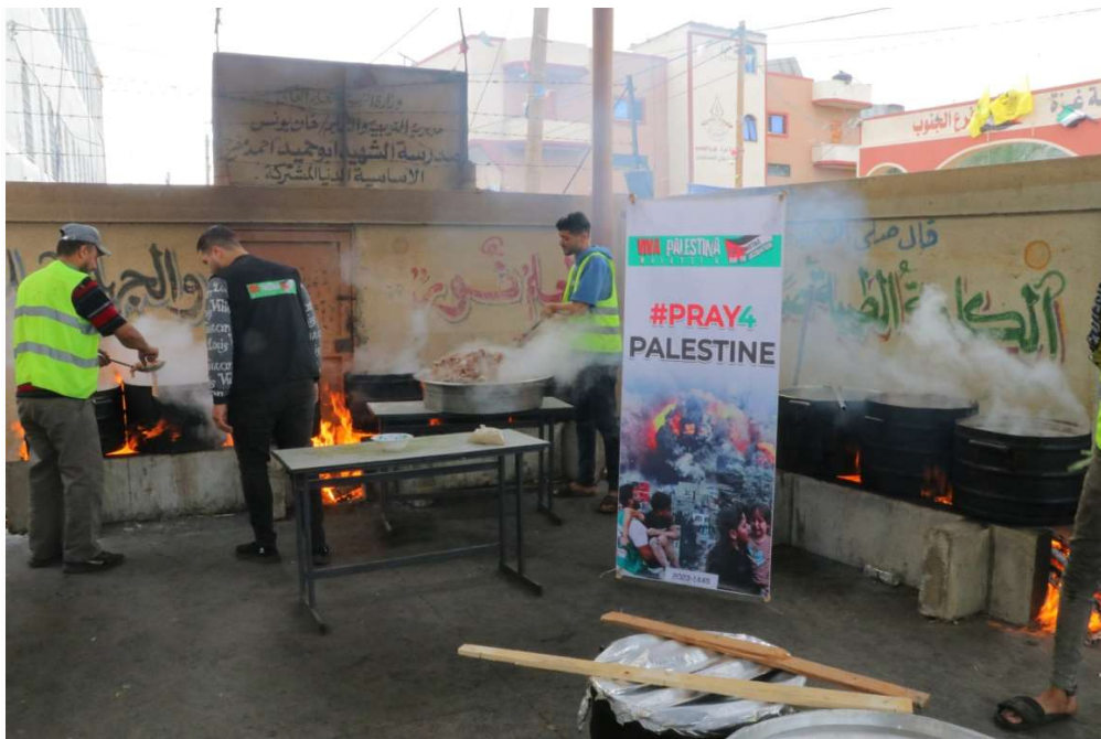
Hot Meals prepared for the IDP in South Gaza shelters by VPM workers