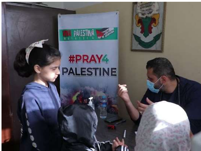
Mobile Clinics were organized in South Gaza to address the health needs of the sick and injured