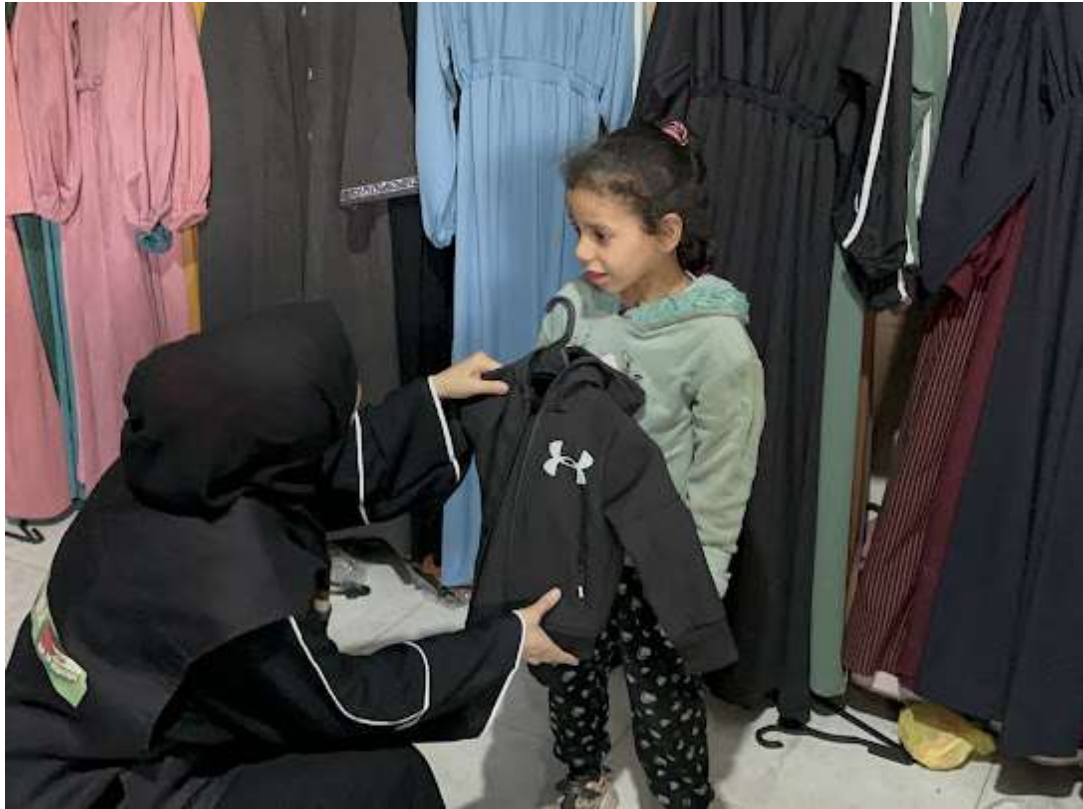
Warm clothings were provided to the poor IDP families in South Gaza.