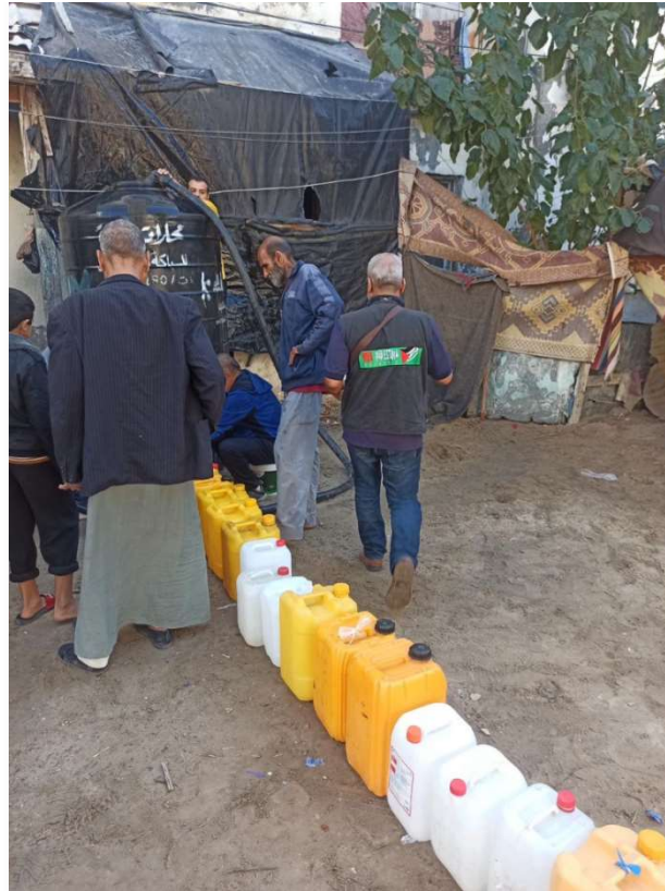
Safe and clean water were distributed to the IDP families in South Gaza.